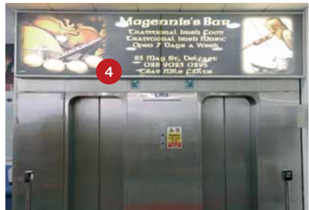
4 Site 4

Large lightbox on entrance to Welcome Centre.