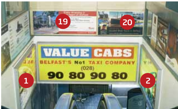
1 Site 1

Our lightboxes are the ideal opportunity to showcase your business - and all four are in prominent positions within the Welcome Centre. All you need to do is provide us with a duratran of your image. Lightbox supplied.