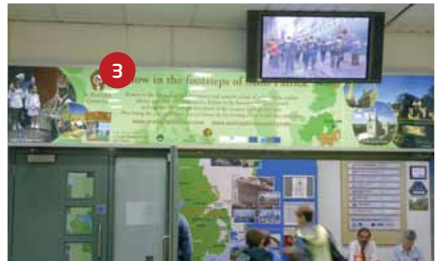
3 Site 3